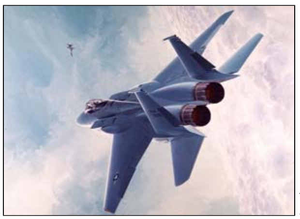
Air Superiority, Blue," Cold War era; F-15 performs barrel roll in fictional 1970s fight with Soviet Su-15.

In 1976—ironically, the nation's Bicentennial Year—Ferris persuaded the authorities to eliminate red, white, and blue from the national insignia. Ferris later told the New York Times, "If you're going to camouflage a plane in the first place, it makes sense to avoid conspicuous insignia and unit emblems." Deception is a key interest. One of Ferris' patents covers the false canopies painted on the underside of A-10s and Canadian CF-18 fighters, which make it difficult for opponents to know what these airplanes are actually doing in flight.